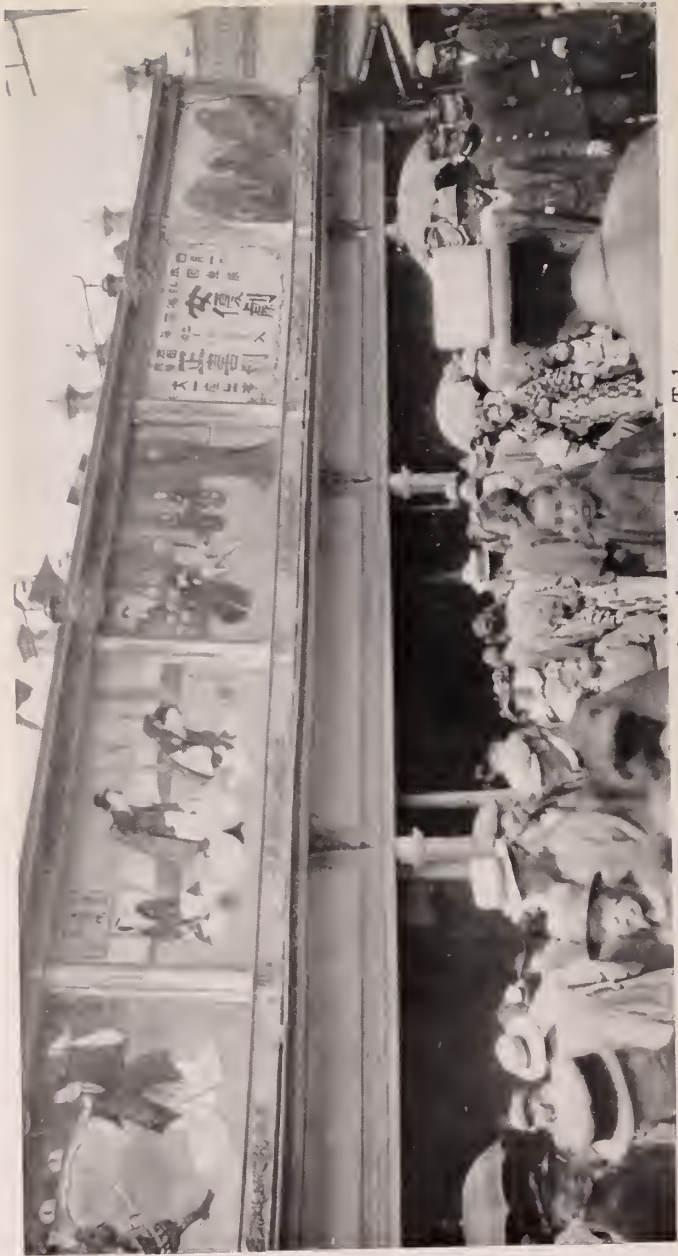
The exterior of a moving-picture theatre in Tokyo